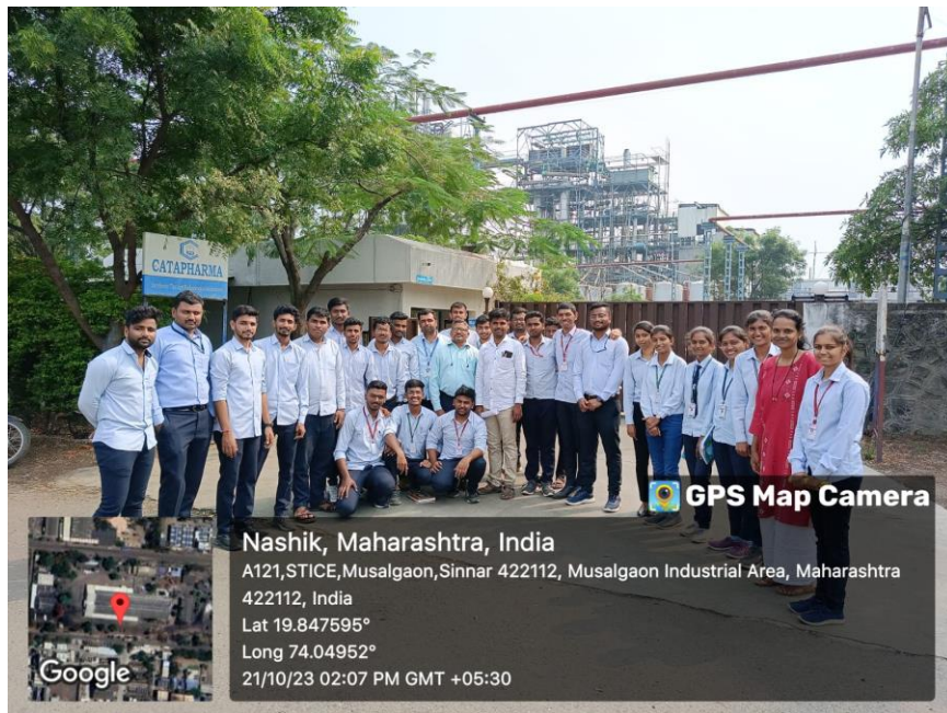
Industrial Visit to Catapharama Chemicals PVT. Ltd. Sinnar on 21-10-2-23