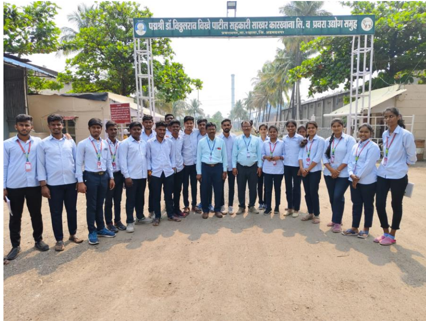
Industrial Visit to P. Dr. Vitthalrao Vikhe Patil Sahakari Sakhar Karkhana, Pravaranagar on 20-10-2-23