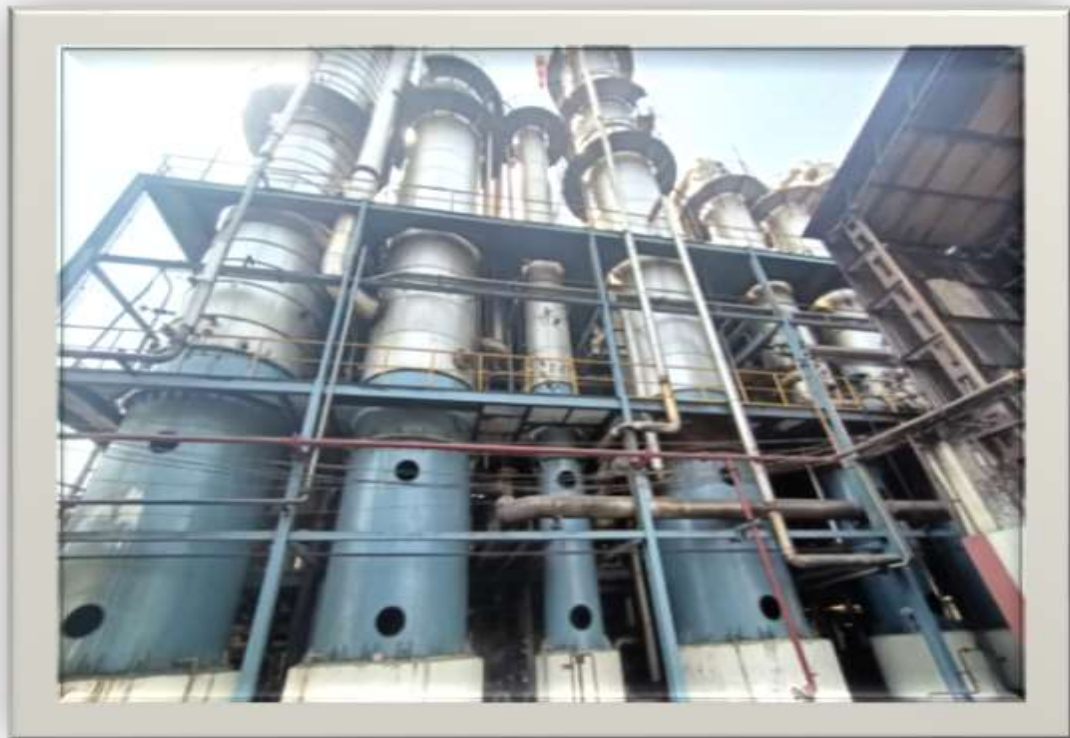
Industrial Visit to P. Dr. Vikhe Patil Sahakari Sakhar Karkhana, Pravaranagar on 04-03-2022

Approved by AICTE, New Delhi vide letter No. F- 27-29 / 91 / AICTE / US (PG) dt. 20/09/93